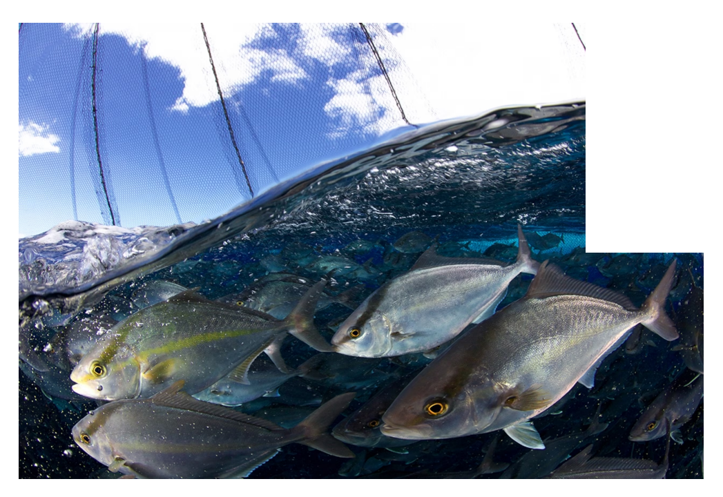
Hawaiian kanpachi ( Seriola rivoliana) are grown from egg to harvest at Keahole Point in Kona, Hawaii.

Along the coasts in U.S. state waters, you can find shellfish farms from Virginia to Maine, trout hatcheries in Washington State, and salmon recirculating aquaculture systems in Florida. But the country only has one offshore farm placed in federal waters, the one off the coast of Hawaii.