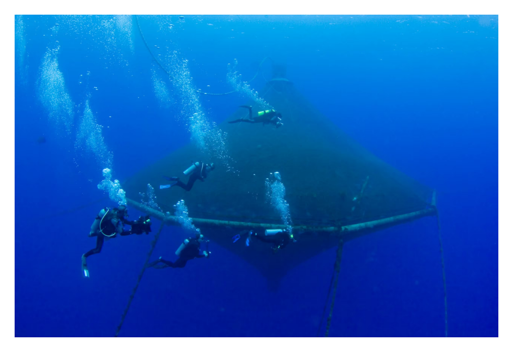
Divers inspect an enclosure holding Almaco jack (Seriola rivoliana) at a fish farm off the Big Island, Hawaii.

But for an offshore farm today in any other state, receiving permits is a timely, costly, and fragmented process; the Environmental Protection Agency, U.S. Coast Guard, National Oceanic and Atmospheric Administration, Army Corps of Engineers, and the state all <u>have a say and</u> a role in issuing permits and reviewing business plans. The public has opportunities to weigh in throughout the process, and lawsuits are also common, such as an animal rights group that's sued the Environmental Protection Agency for its approval for an offshore demonstration permit off the coast of Sarasota, Florida.